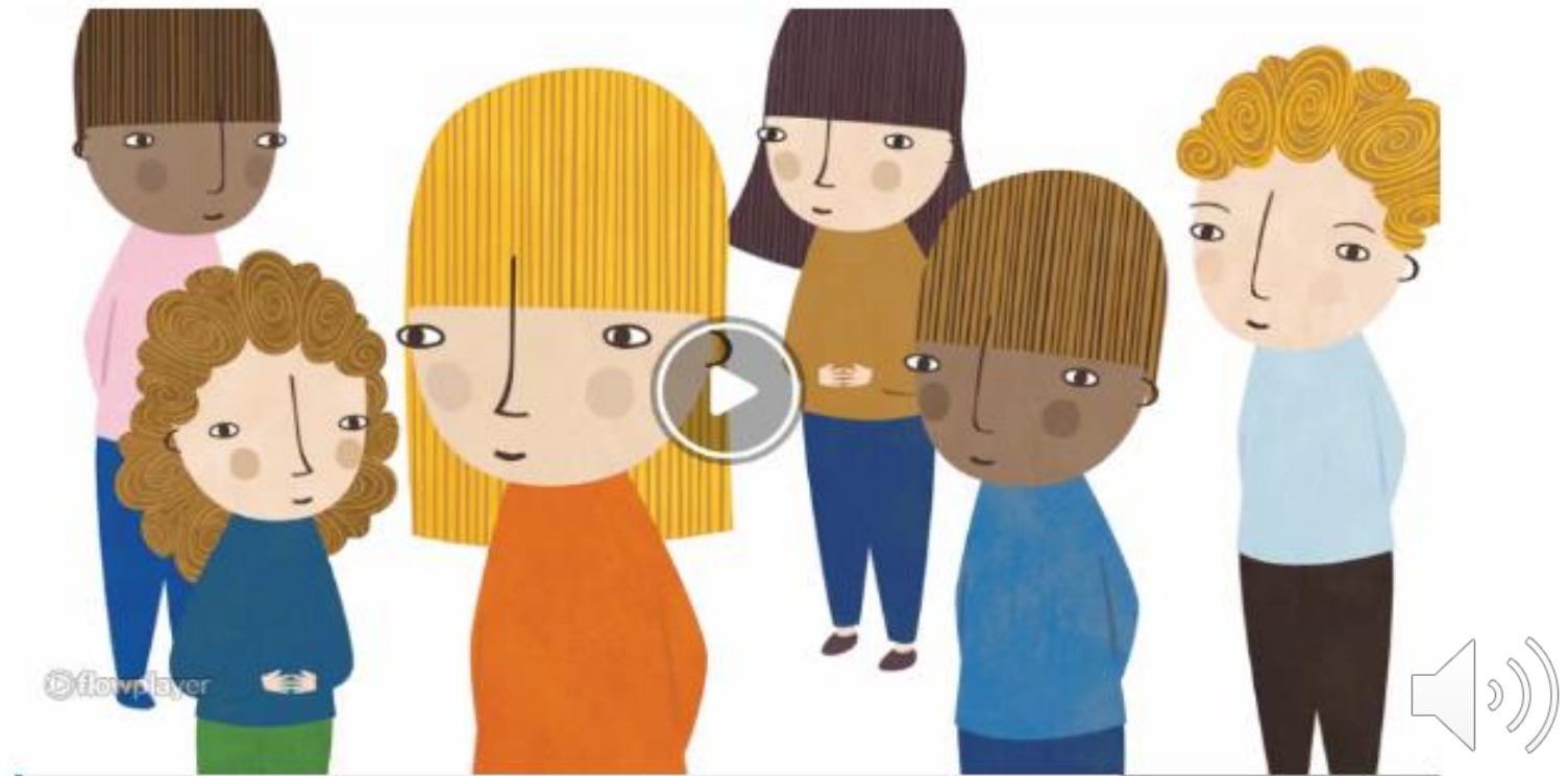
Video: Identifying signs of abuse